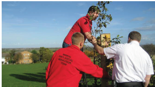
Grange Park, West Kirby

The Grange Park area of West Kirby saw environmental improvements led by the Friends of Grange Park residents' group with the planting of cherry trees and a lantern making workshop with children and young people. Tower Grounds in New Brighton saw local residents lead on an environmental audit with agencies. Work was undertaken in partnership with Leasowe Community Homes, taking the opportunity to speak with residents and young people attending the annual 'Unity in our Community' Halloween fancy dress party.